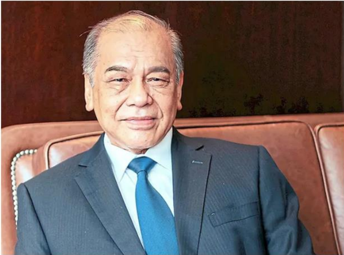
Fajarbaru group executive chairman Tan Sri Chan Kong Choy.